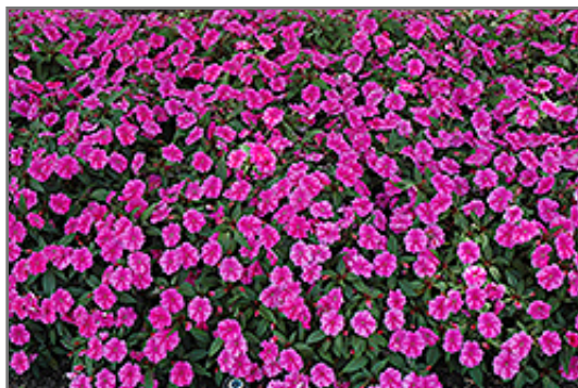
Bounce Pink Flame Impatiens in bloom