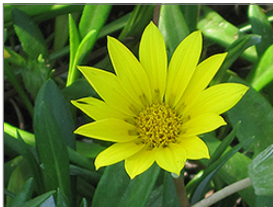
Trailing Gazania flowers

Trailing Gazania is recommended for the following landscape applications;