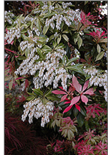
Valley Fire Japanese Pieris flowers

Valley Fire Japanese Pieris is recommended for the following landscape applications;