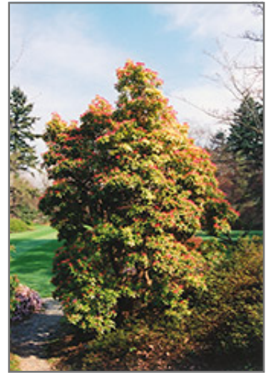
Valley Fire Japanese Pieris

This shrub does best in full sun to partial shade. It requires an evenly moist well-drained soil for optimal growth, but will die in standing water. It is very fussy about its soil conditions and must have rich, acidic soils to ensure success, and is subject to chlorosis (yellowing) of the foliage in alkaline soils. It is somewhat tolerant of urban pollution, and will benefit from being planted in a relatively sheltered location. Consider applying a thick mulch around the root zone in winter to protect it in exposed locations or colder microclimates. This is a selected variety of a species not originally from North America, and parts of it are known to be toxic to humans and animals, so care should be exercised in planting it around children and pets.