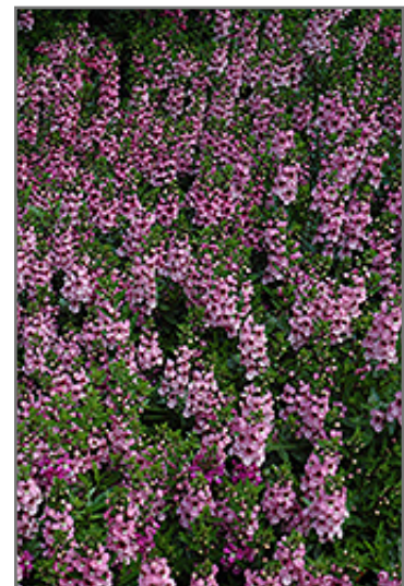
Serenita Pink Angelonia in bloom