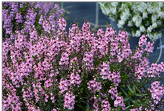
Serenita Pink Angelonia in bloom