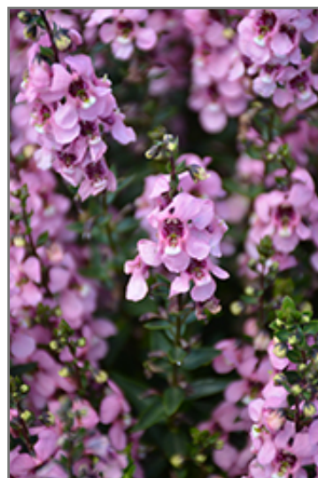
Serenita Pink Angelonia flowers