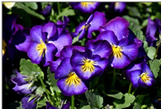
Halo Violet Pansy flowers

This plant will require occasional maintenance and upkeep, and should only be pruned after flowering to avoid removing any of the current season's flowers. Deer don't particularly care for this plant and will usually leave it alone in favor of tastier treats. Gardeners should be aware of the following characteristic(s) that may warrant special consideration;