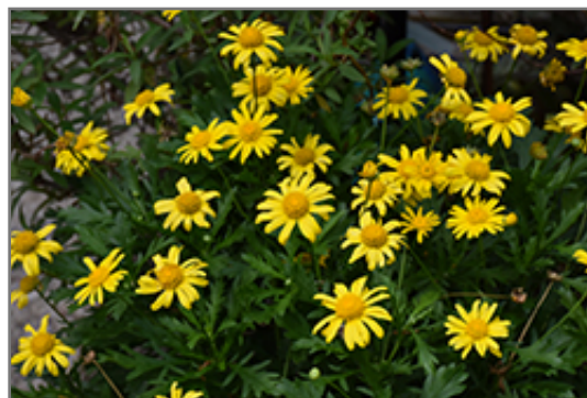
Sonnenschein African Bush Daisy flowers