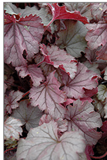
Little Cuties Sugar Berry Coral Bells foliage

Little Cuties Sugar Berry Coral Bells is recommended for the following landscape applications;