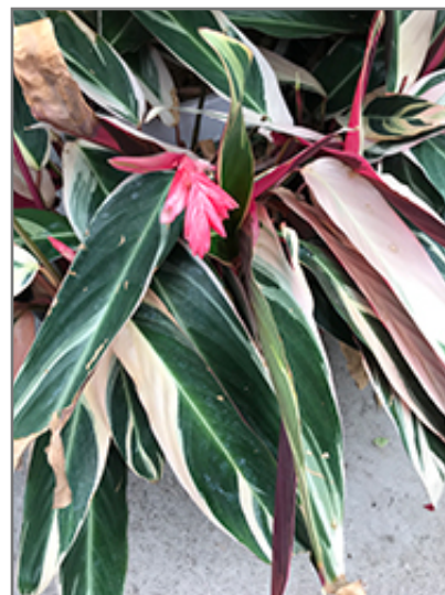
Tricolor Stromanthe flowers

This plant does best in full sun to partial shade. It prefers to grow in average to moist conditions, and shouldn't be allowed to dry out. It is not particular as to soil pH, but grows best in rich soils. It is somewhat tolerant of urban pollution. This is a selected variety of a species not originally from North America. It can be propagated by division; however, as a cultivated variety, be aware that it may be subject to certain restrictions or prohibitions on propagation.