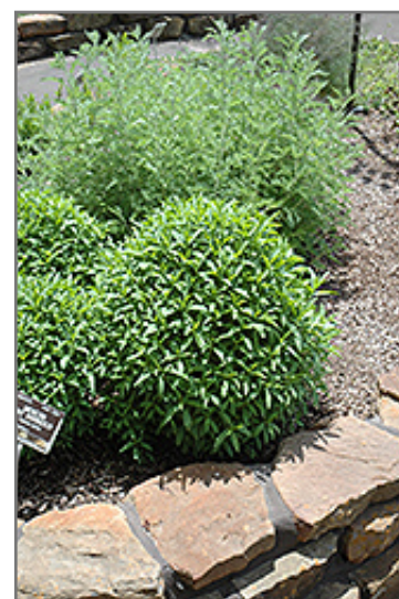
Mexican Tarragon