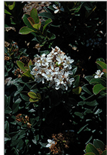
Snow White Indian Hawthorn flowers