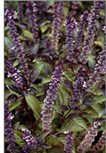
Red Rubin Basil flowers

Red Rubin Basil will grow to be about 16 inches tall at maturity, with a spread of 12 inches. When grown in masses or used as a bedding plant, individual plants should be spaced approximately 10 inches apart. This fast-growing annual will normally live for one full growing season, needing replacement the following year.