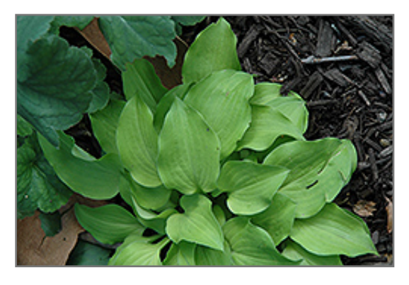
Jiminy Cricket Hosta foliage