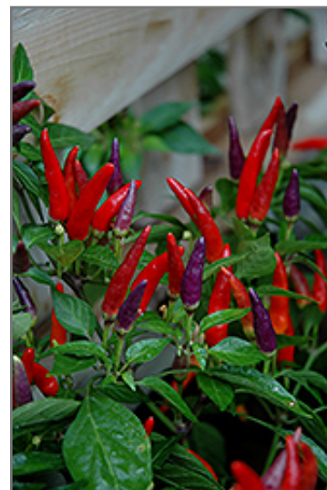
Sangria Ornamental Pepper fruit