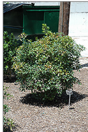
LeAnn Cleyera

LeAnn Cleyera makes a fine choice for the outdoor landscape, but it is also well-suited for use in outdoor pots and containers. Because of its height, it is often used as a 'thriller' in the 'spiller-thriller-filler' container combination; plant it near the center of the pot, surrounded by smaller plants and those that spill over the edges. It is even sizeable enough that it can be grown alone in a suitable container. Note that when grown in a container, it may not perform exactly as indicated on the tag - this is to be expected. Also note that when growing plants in outdoor containers and baskets, they may require more frequent waterings than they would in the yard or garden.