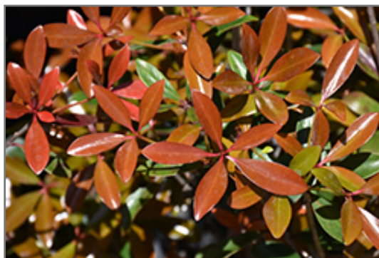
LeAnn Cleyera foliage