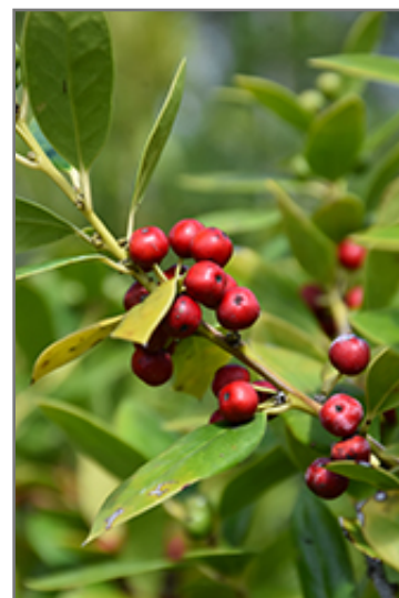
Needlepoint Chinese Holly fruit