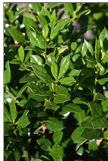
Needlepoint Chinese Holly foliage

Needlepoint Chinese Holly is recommended for the following landscape applications;