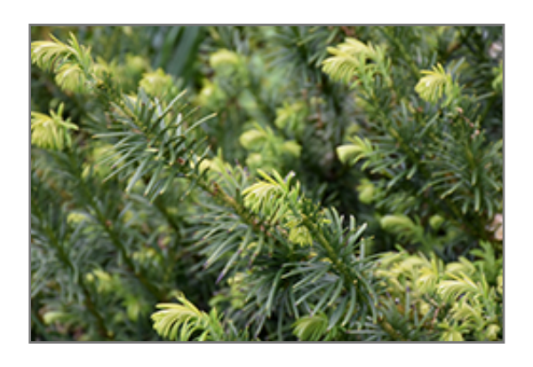
Yewtopia Plum Yew foliage

This is a relatively low maintenance shrub, and is best pruned in late winter once the threat of extreme cold has passed. Deer don't particularly care for this plant and will usually leave it alone in favor of tastier treats. It has no significant negative characteristics.