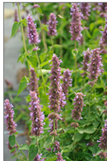
Blue Boa Hyssop flowers

Blue Boa Hyssop is recommended for the following landscape applications;