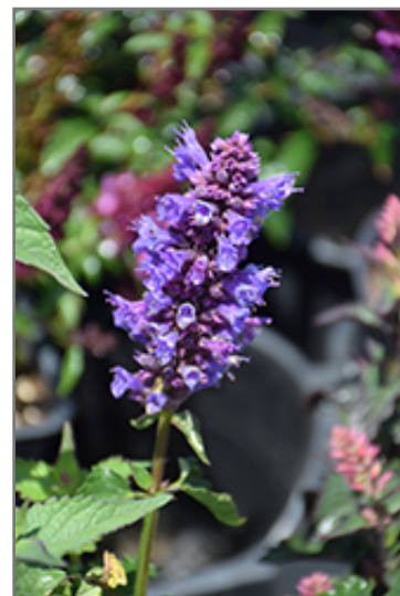
Blue Boa Hyssop flowers

Blue Boa Hyssop is a fine choice for the garden, but it is also a good selection for planting in outdoor pots and containers. With its upright habit of growth, it is best suited for use as a 'thriller' in the 'spiller-thriller-filler' container combination; plant it near the center of the pot, surrounded by smaller plants and those that spill over the edges. Note that when growing plants in outdoor containers and baskets, they may require more frequent waterings than they would in the yard or garden.