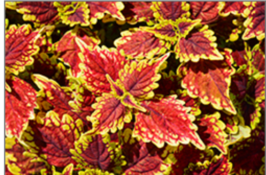
Oxford Street Coleus foliage