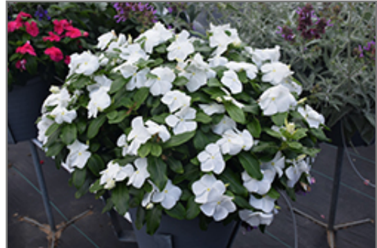
Titan Pure White Vinca in bloom

Titan Pure White Vinca will grow to be about 14 inches tall at maturity, with a spread of 12 inches. Its foliage tends to remain dense right to the ground, not requiring facer plants in front. Although it's not a true annual, this fast-growing plant can be expected to behave as an annual in our climate if left outdoors over the winter, usually needing replacement the following year. As such, gardeners should take into consideration that it will perform differently than it would in its native habitat.