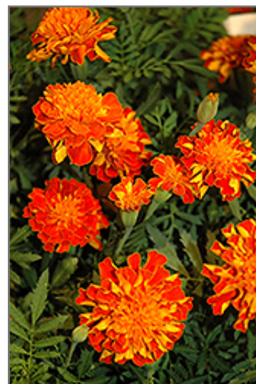
Cresta Flame Marigold flowers