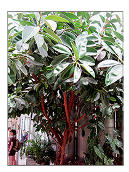
Rubber Tree