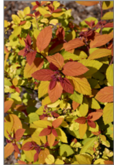
Double Play Big Bang Spirea foliage

This shrub should only be grown in full sunlight. It prefers to grow in average to moist conditions, and shouldn't be allowed to dry out. It is not particular as to soil type or pH. It is highly tolerant of urban pollution and will even thrive in inner city environments. This particular variety is an interspecific hybrid.