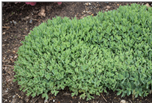
Rock 'N Round Pure Joy Stonecrop