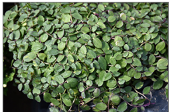
County Park Star Creeper foliage