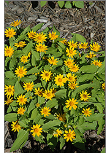
Million Gold Melampodium flowers

Million Gold Melampodium is recommended for the following landscape applications;