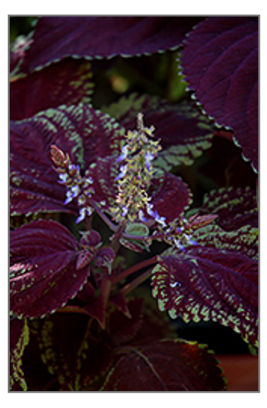
Emotions Sophisticated Coleus foliage