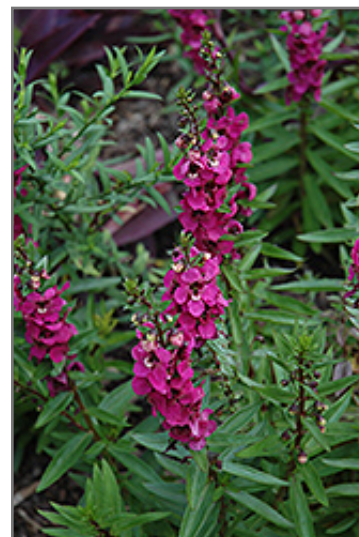
Serenita Raspberry Angelonia flowers

This plant will require occasional maintenance and upkeep, and should not require much pruning, except when necessary, such as to remove dieback. It is a good choice for attracting butterflies to your yard, but is not particularly attractive to deer who tend to leave it alone in favor of tastier treats. It has no significant negative characteristics.