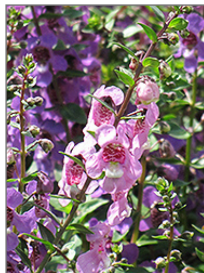
Serena Lavender Pink Angelonia flowers