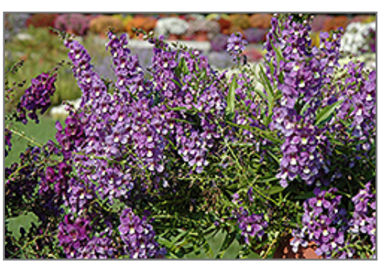
AngelMist Spreading Blue Angelonia flowers

AngelMist Spreading Blue Angelonia is recommended for the following landscape applications;