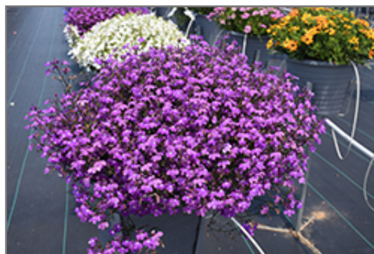
Techno Violet Lobelia in bloom