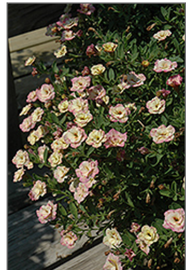
MiniFamous Double Rose Chai Calibrachoa flowers