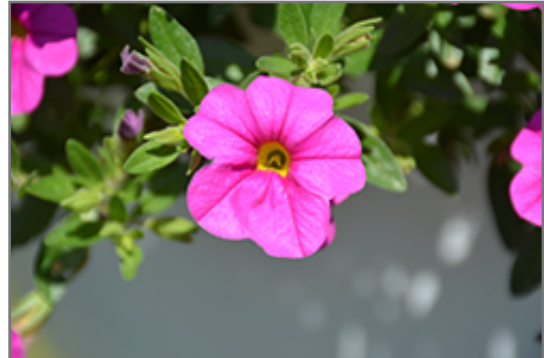
Lindura Pink Calibrachoa flowers

Lindura Pink Calibrachoa is recommended for the following landscape applications;