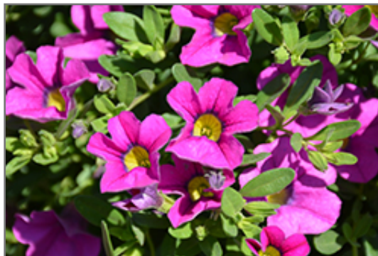
Million Bells Trailing Pink Calibrachoa flowers

Million Bells Trailing Pink Calibrachoa is recommended for the following landscape applications;