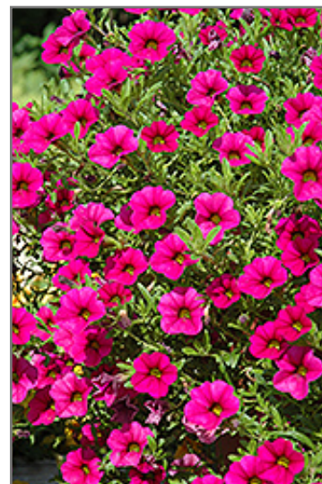
Cabaret Rose Calibrachoa flowers