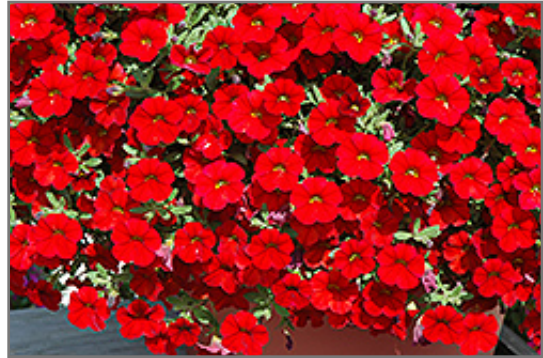
Cabaret Bright Red Calibrachoa flowers

Cabaret Bright Red Calibrachoa is recommended for the following landscape applications;