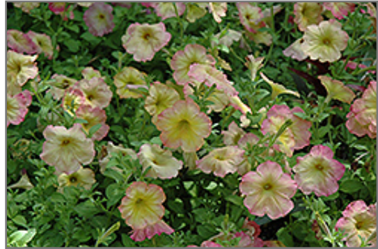
Debonair Dusty Rose Petunia flowers

Debonair Dusty Rose Petunia is recommended for the following landscape applications;