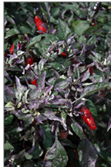
Calico Ornamental Pepper fruit