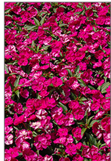
Fanfare Fuchsia Impatiens flowers