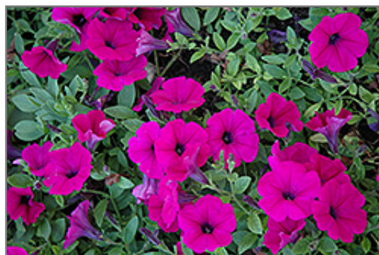
Wave Purple Classic Petunia flowers