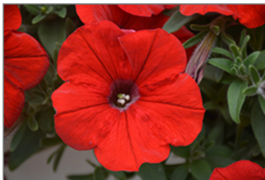
Sweetunia Hot Rod Red Petunia flowers