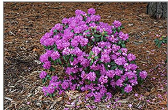
Compact P.J.M. Rhododendron in bloom