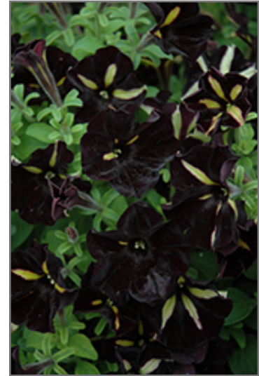
Phantom Petunia flowers