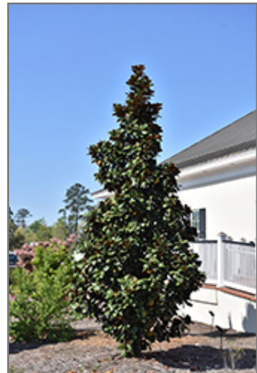
Teddy Bear Magnolia