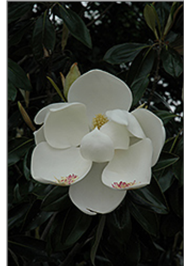
Teddy Bear Magnolia flowers

Teddy Bear Magnolia will grow to be about 20 feet tall at maturity, with a spread of 12 feet. It has a low canopy with a typical clearance of 2 feet from the ground, and is suitable for planting under power lines. It grows at a medium rate, and under ideal conditions can be expected to live for 70 years or more.