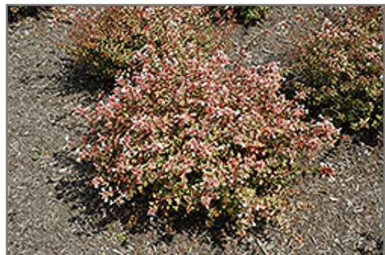
Sunshine Daydream Abelia in bloom