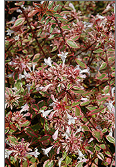
Sunshine Daydream Abelia flowers

Sunshine Daydream Abelia is recommended for the following landscape applications;