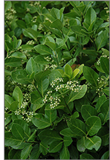
Manhattan Spreading Euonymus flowers

This shrub performs well in both full sun and full shade. It is very adaptable to both dry and moist locations, and should do just fine under average home landscape conditions. It is not particular as to soil type or pH. It is highly tolerant of urban pollution and will even thrive in inner city environments, and will benefit from being planted in a relatively sheltered location. This is a selected variety of a species not originally from North America.