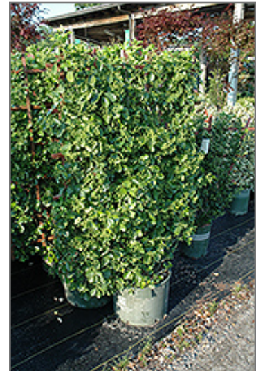
Manhattan Spreading Euonymus