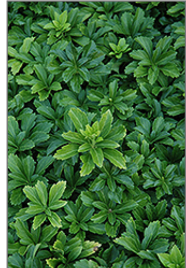
Green Sheen Japanese Spurge foliage